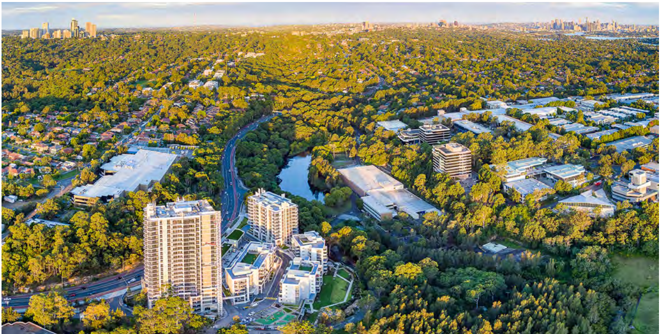
© Arise, Lane Cove by Meriton

Regardless of your role, this course is essential for those wanting to progress their career in project management within the property development industry.