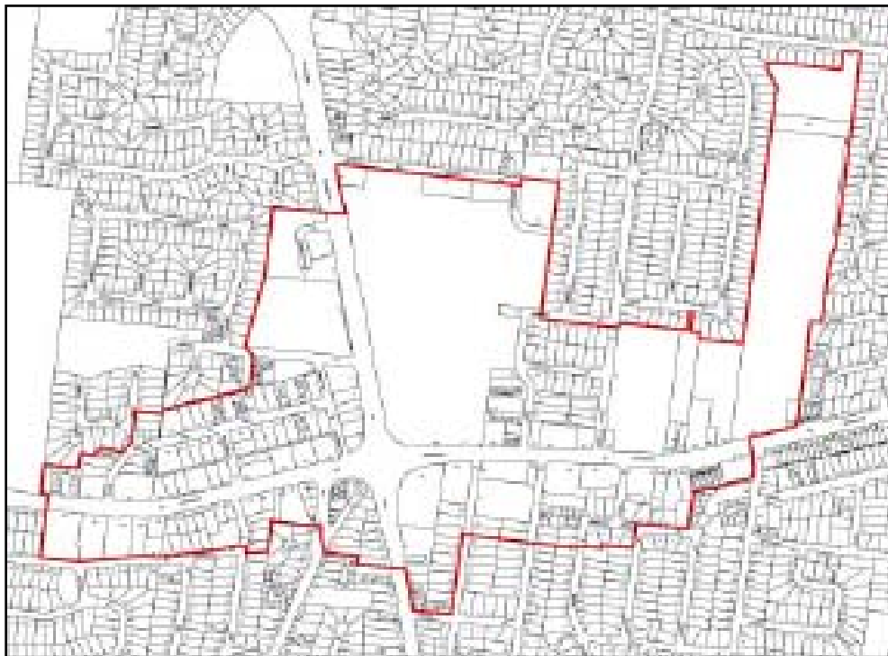
Figure 1: Doncaster Hill Activity Centre Boundary

The infrastructure charges per unit of residential development and per 121 sqm of commercial floor space and 19sqm of retail floor space are outlined below.